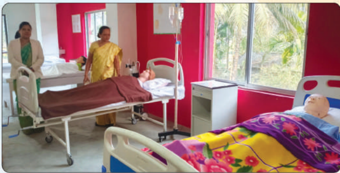
Nursing Foundation Lab-2