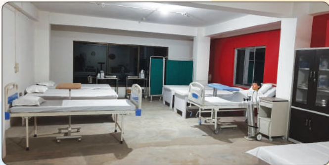
Nursing Foundation Lab-1