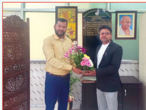
Director of Brahmaputra College felicitating the Registrar of SSUHS