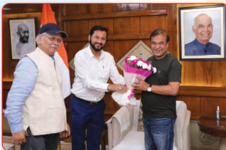
Director of Brahmaputra College felicitating the Hon'ble Chief Minister of Assam