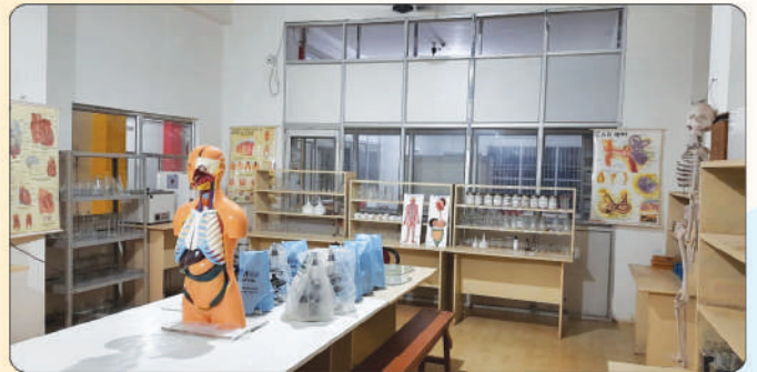
Anatomy & Physiology Lab