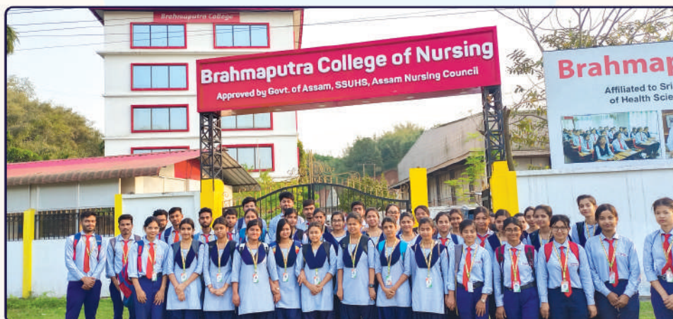
College Campus at Sonapur (Near Tetelia)