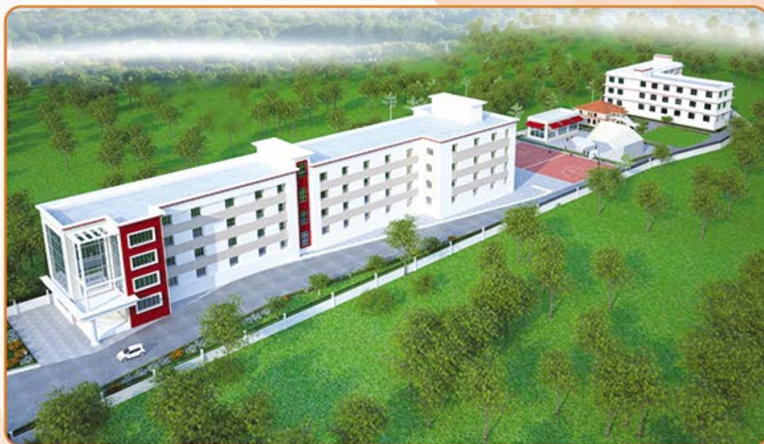
Proposed view of Main Campus, Sonapur, Kamrup (M), Assam