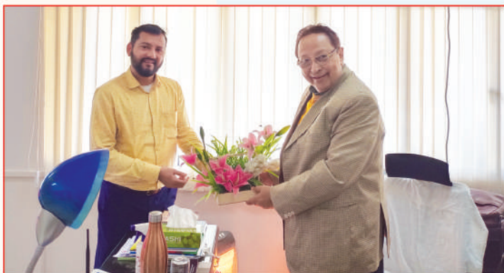
Director of Brahmaputra College felicitating the Hon'ble Vice-Chancellor of SSUHS